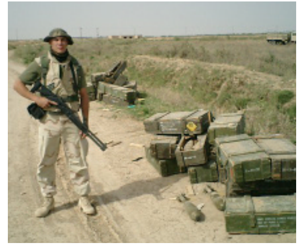
Here he is stockpiling some weapons for next years OMBAC's game!!