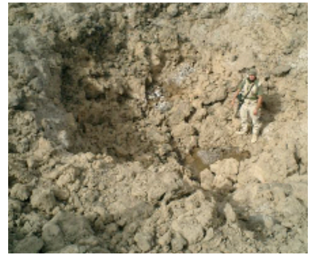
This is Cass in a bomb crater!

These photos are from Cass who of course is over in Iraq