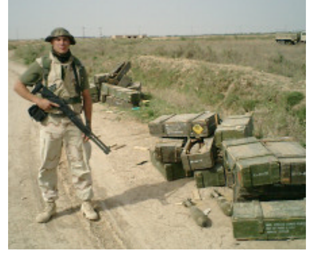
Here he is stockpiling some weapons for next years OMBAC's game!!