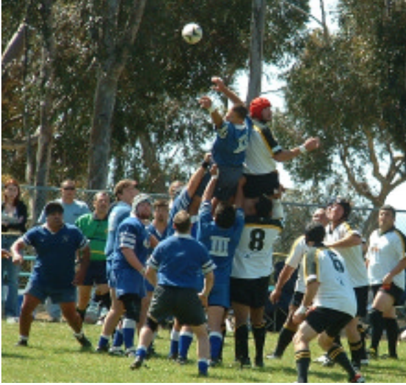
Game #7 - Lost to SOC Away 22-27.

nearly every time. Even though we knew what to expect and trained specifically to counter them, it was a sobering eye-opener. Few of us had played against talent like that. 2nd team won 12-0 against surprisingly weak Riverside B team, giving us hope that maybe Riverside did not have much depth. Again A/B win loss pattern continues.